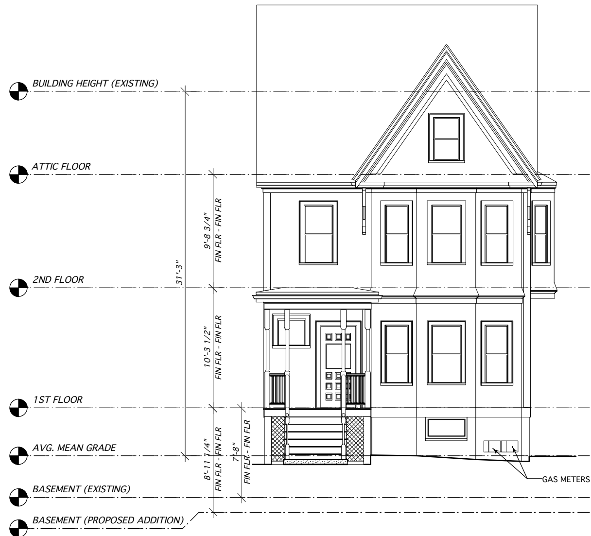
1 PROPOSED BUILDING ELEVATION - FRONT Scale: 1/8" = 1'-0"