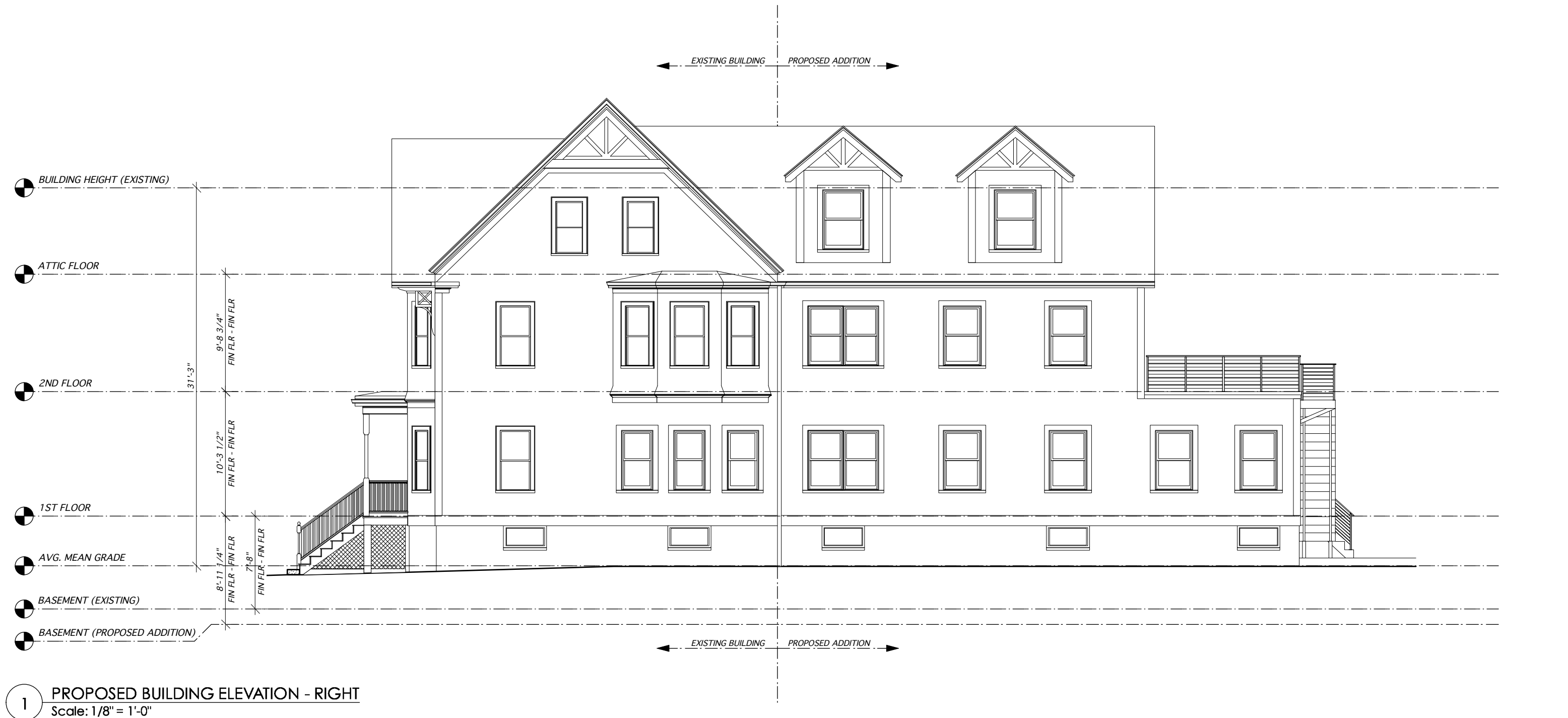
1 PROPOSED BUILDING ELEVATION - RIGHT Scale: 1/8" = 1'-0"